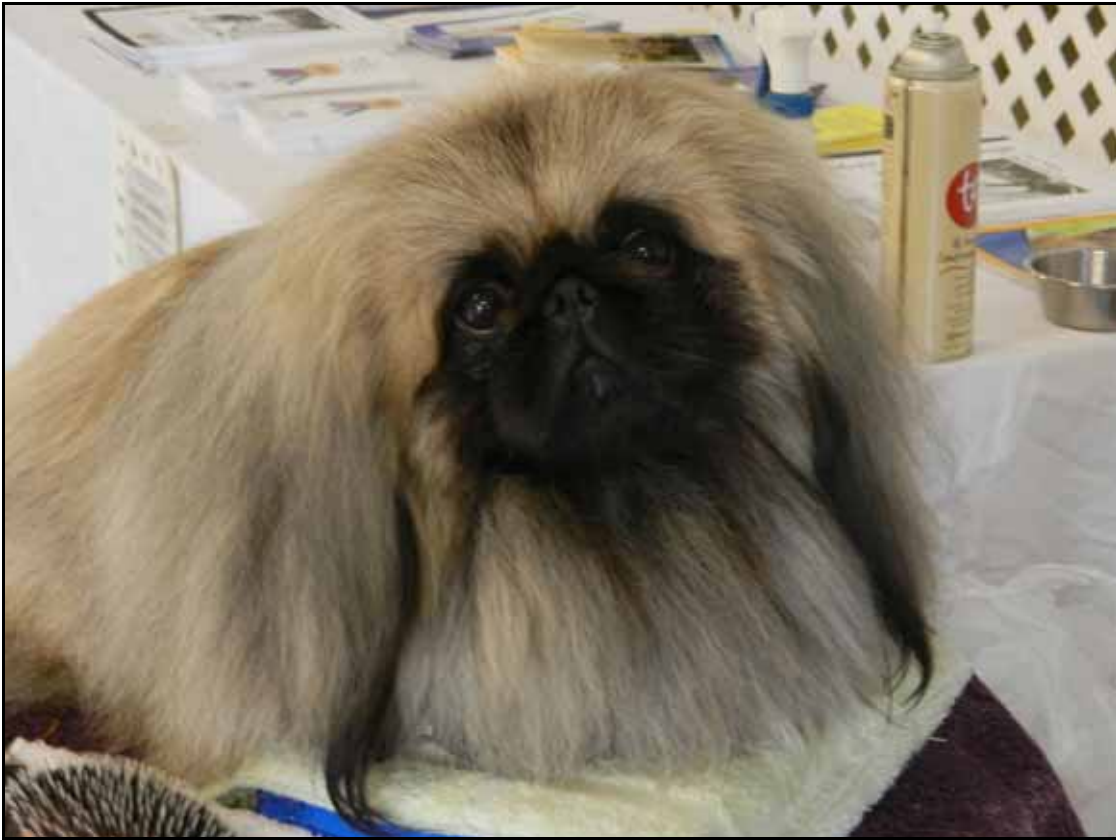
BEST ADULT IN MATCH