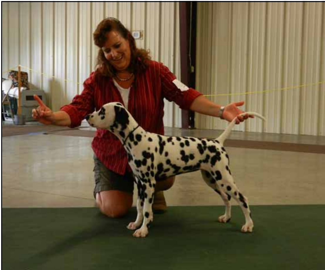
BEST PUPPY AND BEST IN MATCH