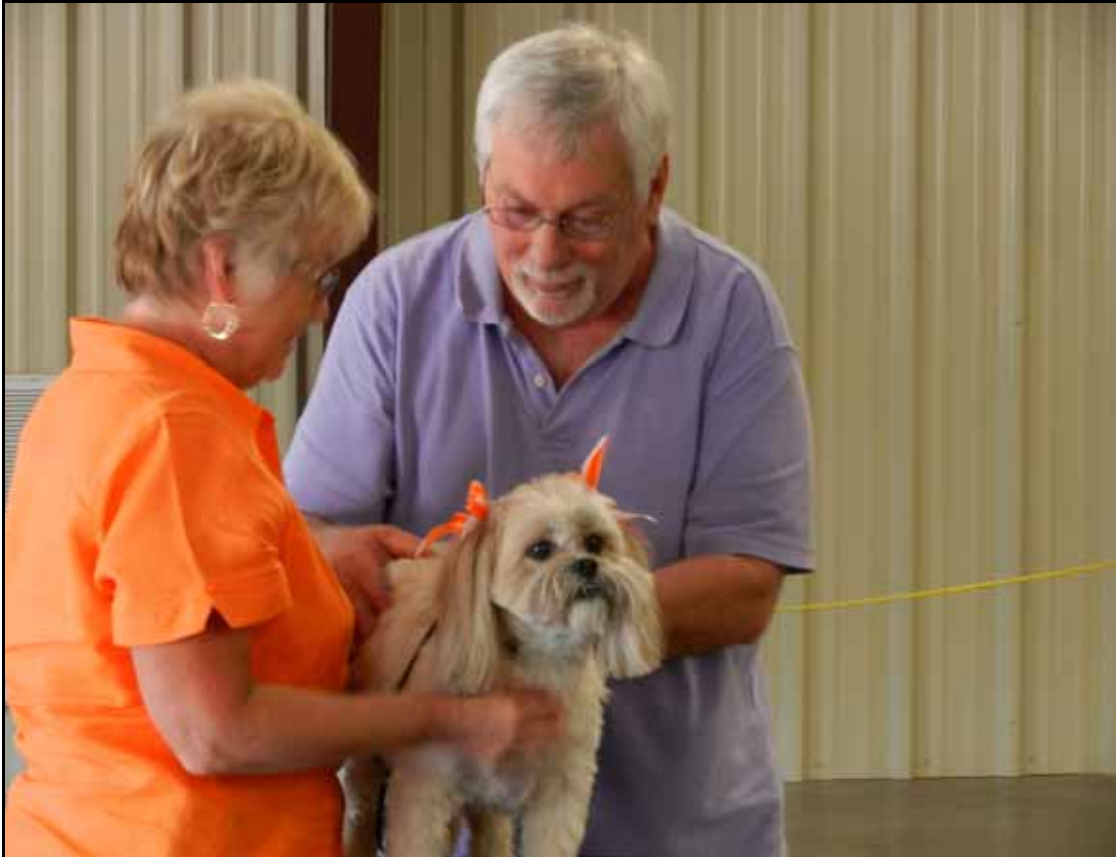
BEST MIXED BREED IN MATCH